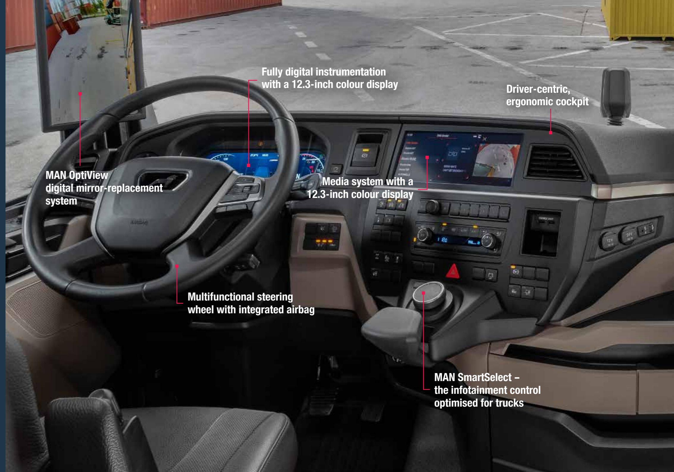
MAN OptiView digital mirror-replacement system