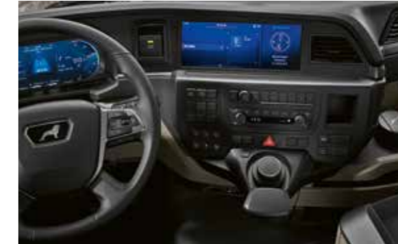
Infotainment system with 12-inch display and MAN SmartSelect

The infotainment system can be operated either via a classic control system with buttons or via MAN SmartSelect (can be combined from version Advanced 7-inch). Throughout, familiar usage meets innovative comfort. The result is one you can see and feel, too, as high-quality surfaces make every journey with the new MAN TGS tangibly special.