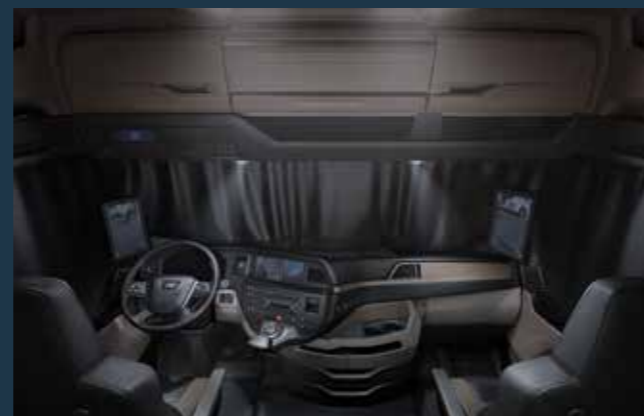
Spacious overhead lockers with a tambour door in the middle