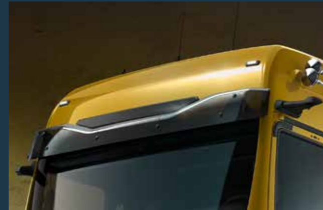
Aerodynamically optimised sun visor

The new design sun visor in dark grey adds a touch of class to the front of the GX and GM cabs. It prevents the driver from being dazzled when the sun is at a steep angle. The new design has been optimised for aerodynamics, resulting in better airflow around the A-pillar at the roof and preventing separation of the air stream which is unfavourable for fuel consumption. This improvement of the drag coefficient (cd value) reduces fuel consumption.