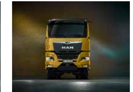
CAB GN: THE ROOMY ONE (wide, long, standard height)