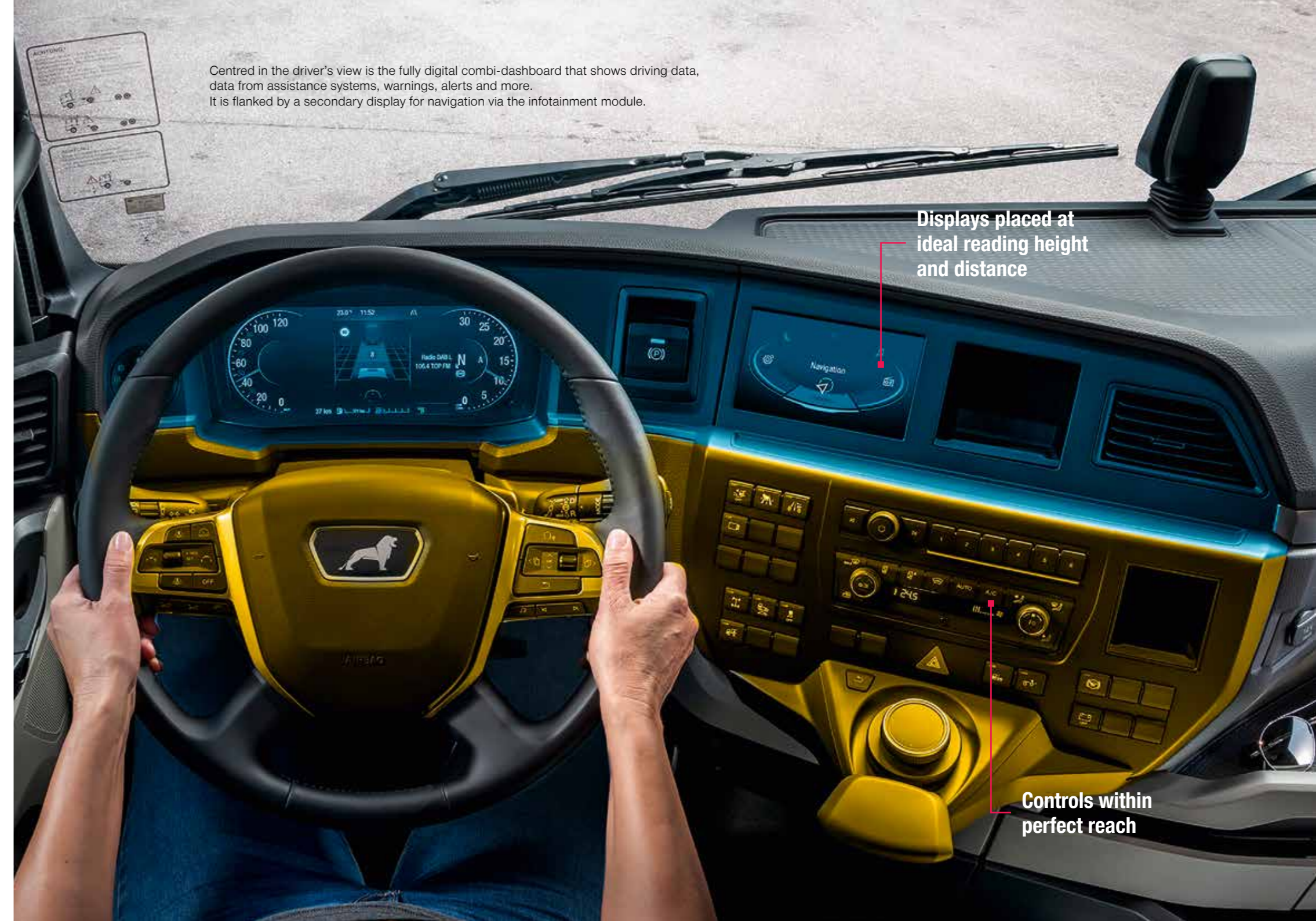
Centred in the driver's view is the fully digital combi-dashboard that shows driving data, data from assistance systems, warnings, alerts and more. It is flanked by a secondary display for navigation via the infotainment module.