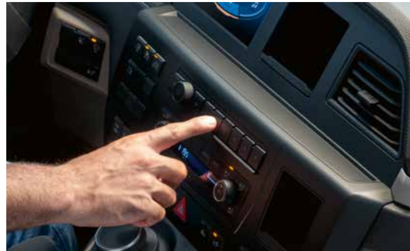
Freely programmable direct access buttons fitted with touch sensors

Theory times experience: the controls for the MAN TGX are the result of combining the latest scientific analyses with insights from intensive on-road tests with drivers.