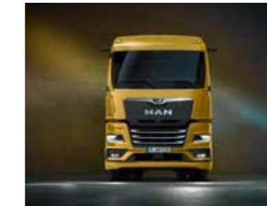
CAB GM: THE GENEROUS ONE (wide, long, medium height)