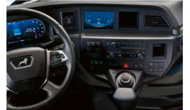
Infotainment system with 7-inch display and MAN SmartSelect