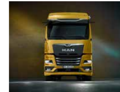
CAB GX: THE MAXIMUM ONE (wide, long, extra height)