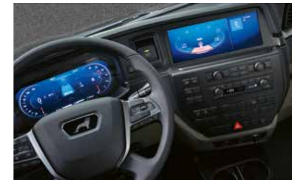
Infotainment system with 12-inch display and control system below the secondary display