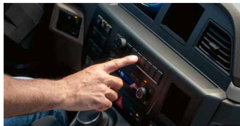
Freely programmable direct access buttons fitted with touch sensors

Theory times experience: the controls for the MAN TGM and TGL are the result of combining the latest scientific analyses with insights from intensive on-road tests with drivers.