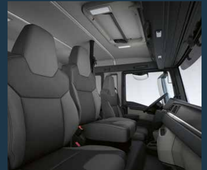
Second passenger seat for the MAN crew cab

Even the stair unit represents a step up: the wide, non-slip steps, optionally available with lighting, are designed for safety. The internal fittings have everything covered, too. The crew cab is not just a practical option, though: its elegant front is designed in the same style as the MAN TG trucks. Aerodynamically optimised features minimise fuel consumption and improve cost-effectiveness.