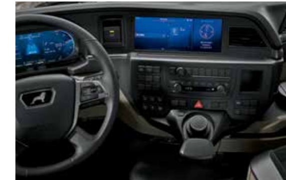
Infotainment system with 12-inch display and MAN SmartSelect

The infotainment system can be operated either via a classic control system with buttons or via MAN SmartSelect (can be combined from version Advanced 7 inch). Throughout, familiar usage meets innovative comfort. The result is one you can see and feel, too, as high-quality surfaces make every journey with the MAN TGM and TGL tangibly special.