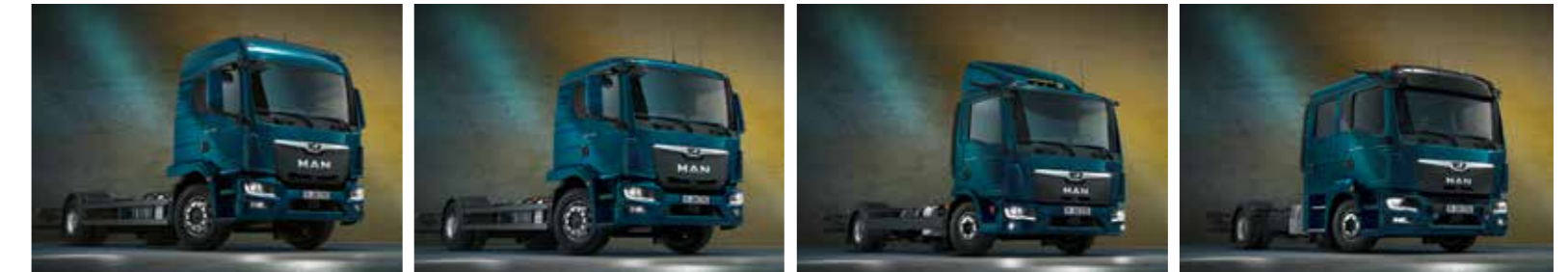
CAB TM: THE COMFY ONE