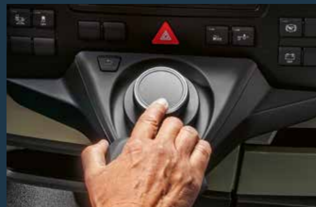
Innovative MAN SmartSelect multimedia control

One feature is even an absolute first: the trailblazing MAN SmartSelect system, which was developed together with our customers, makes using the multimedia system child's play even in demanding driving situations. Here, too, comfort was our inspiration for eliminating the touch-screen. With MAN SmartSelect, functions such as maps, music, cameras and more can be selected via a user-friendly dial with hand rest. There's so much more to discover in our driver's cabs, so get in, get comfortable and enjoy all the possibilities.