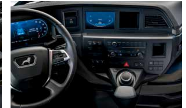
Infotainment system with 7-inch display and MAN SmartSelect