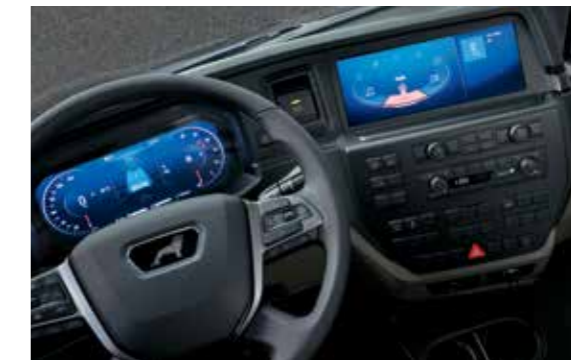
Infotainment system with 12-inch display and control system below the secondary display