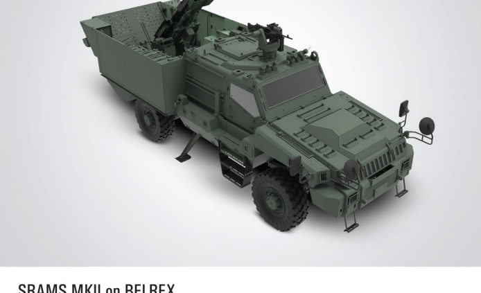
SRAMS MKII on BELREX