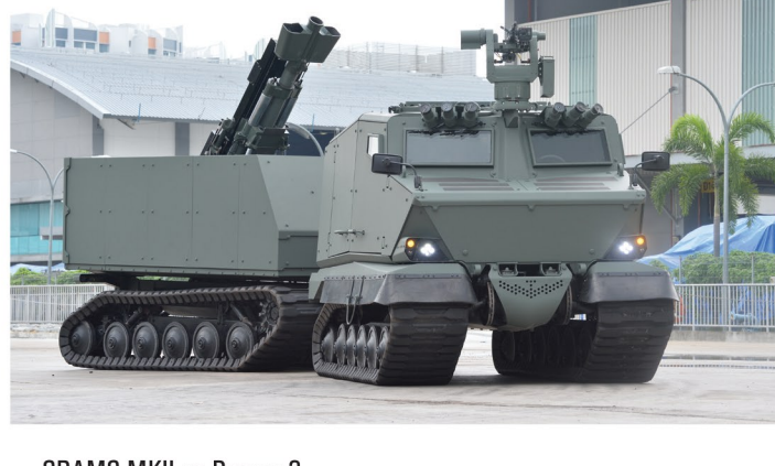
SRAMS MKII on Bronco 3