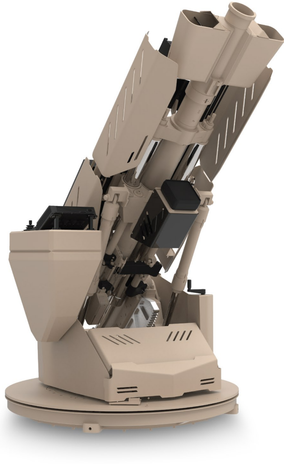
SRAMS in Operational Position