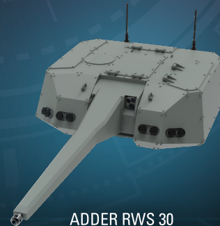
ADDER RWS 30