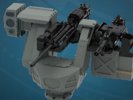
ADDER RWS TWIN