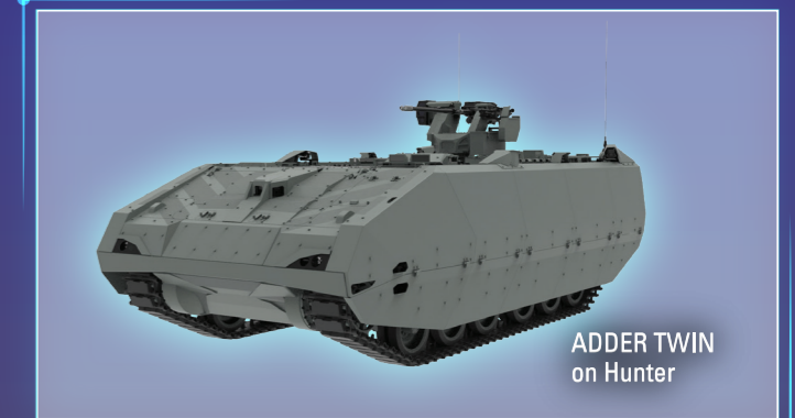
ADDER TWIN on Hunter

Can be integrated on any tracked, wheeled vehicle or marine vessel.