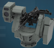
ADDER RWS LITE