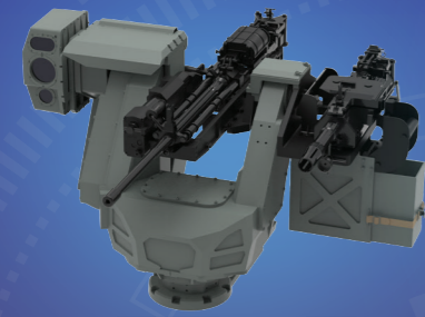
ADDER RWS 12.7/40 TWIN