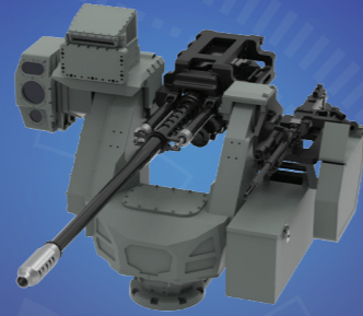
ADDER RWS LW30/7.62 TWIN