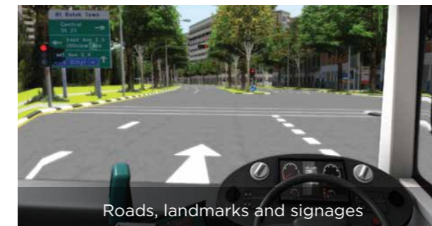
Roads, landmarks and signages