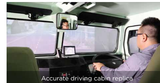
Accurate driving cabin replica