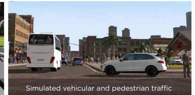
Simulated vehicular and pedestrian traffic