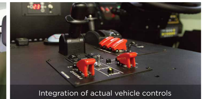
Integration of actual vehicle controls